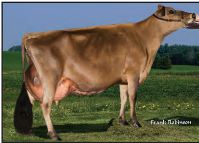
KKF COLOR TEQUILA CORDIE Grandam of Lot 58