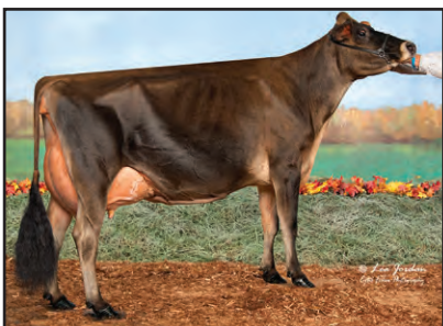
J-KAY EXCITATION FUZZY Sister to the Dam of Lot 42