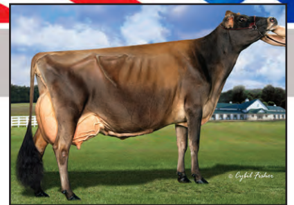
PINE HAVEN SSM MARMIE Great-Grandam of Lot 35