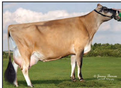
HARMONY CORNERS FREYNI Fourth Dam of Lot 36

4TH DAM: HARMONY CORNERS FREYNI 93% 5-03 305 2 14180 5.0 702 3.6 517 98DCR 1788C