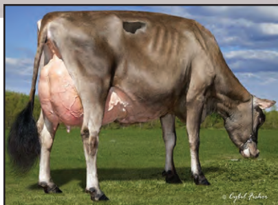
HARMONY CORNERS FOBIA Great-Grandam of Lot 36