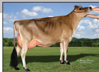
ARETHUSA REAGAN CALYPSO-ET Great-Grandam of Lot 29

4TH DAM: ARETHUSA VERONICAS CUPID-ET 94% 5-06 305 2 18310 4.6 837 3.6 663 95DCR 2258C