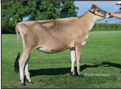
BRIDON BC POLLYANNA Great-Grandam of Lot 10

MOON VALLEY FARM LIMITED BREEDER & OWNER FAIR GROVE, MO 417-880-8999