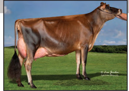
STONEY POINT BELMONT FASHION Great-Grandam of Lot 65

4TH DAM: STONEY POINT VINDICATION FALINE 95% 6-05 305 2 21810 4.3 934 3.7 813 98DCR 2624C 2ND AGED COW, 2015 MARYLAND STATE FAIR 2ND 5-YEAR-OLD, 2014 MARYLAND STATE FAIR 6TH 5-YEAR-OLD, 2014 MID-ATLANTIC REGIONAL