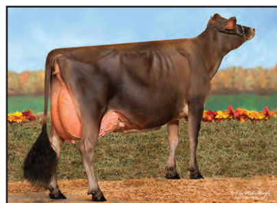
ELLIOTTS COMERICA SABLE-ET Sister to the Grandam of Lot 20