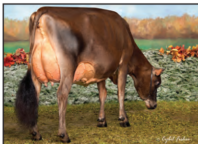
RATLIFF APPLEJACK PENNY Sister to the Dam of Lot 48