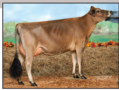
KAN DO CINDY Sister to the Dam of Lot 32