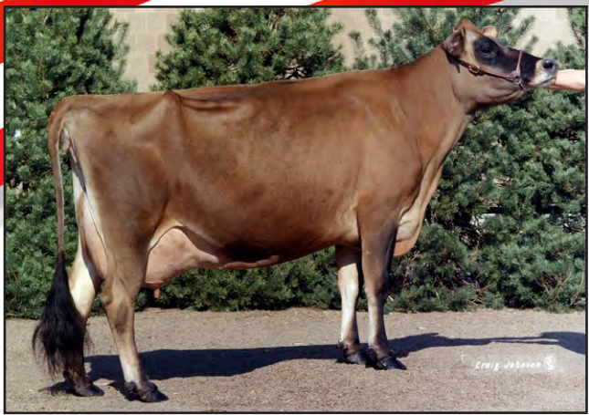
SPECIAL LOU, E-94% Great-Grandam of Lot 32