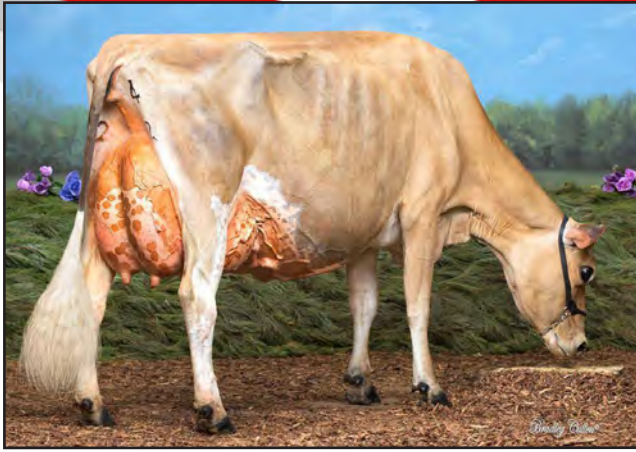
BUSHLEA VAN FERNLEAF, EX 93 (AUS) Two-time IDW Grand Champion Same Family as Lot 31