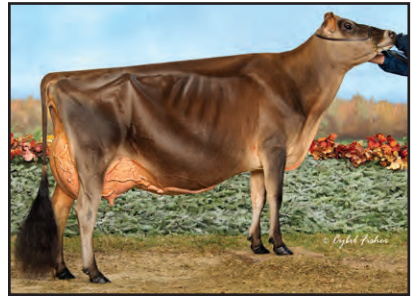
ELLIOTTS BLACKSTONE CHARLOTTE Sister to Lot 59