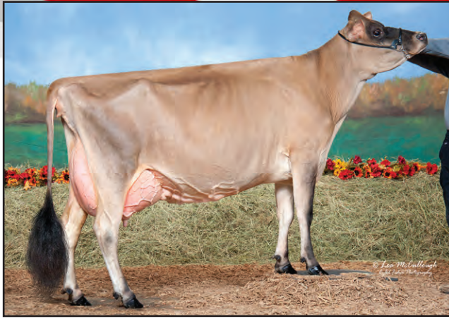
REXLEA COMERICA FUSION, EX 93 (CAN) From the Same Family as Lot 33