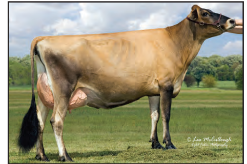
Sold in the 2008 sale HLF Excitation Evita, E-91% 2-9 305 3x 20,160 5.7% 1,141 3.6% 730