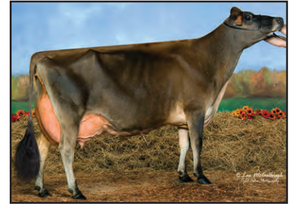
RATLIFF PRICE ALICIA Great-Grandam of Lot 53