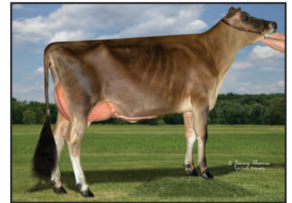
DIXIES ANDREAS DIANA-ET Sister to Lot 9