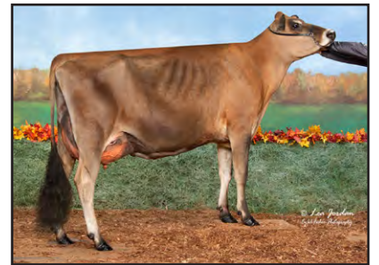
RIVENDALE COLTON DAHLIA-ET Sister to Lot 9