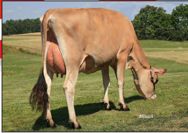
HEATHS HGUN BETTY, E-90% Great-Grandam of Lot 18