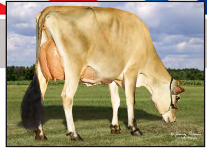
SOUTH MOUNTAIN COLTON CELEBRATE-ET Sister to Lot 19

4TH DAM: GENESIS RENAISSANCE VIVIANNE VG 87 (CAN) 5-00 305 2 12110 4.2 514 3.8 461 CAN 1464C