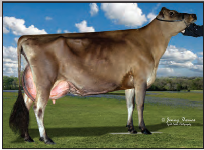
M-SIGNATURE COMERICA TIANA MARIE Great-Grandam of Lot 26