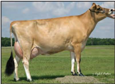
MI WIL DELUXE GORGEOUS Great-Grandam of Lot 4

BORN 03/02/2022 TATTOO /KV16 P0 FEMALE EFI 5.0%