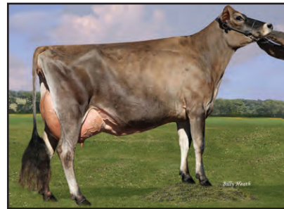
JEMI PREMIER TRIUMPH-ET Sister to Lot 63