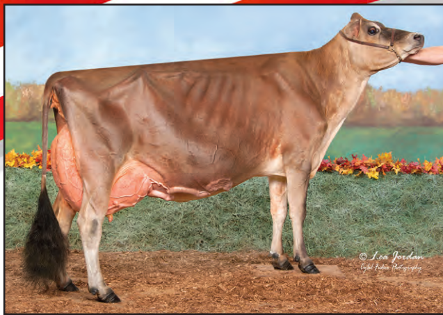
CAMPBELL TB VERB RYHANNA-ET, E-93% Dam of Lot 30