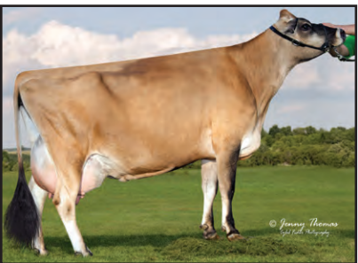
HARMONY CORNERS FREYNI-ET Great-Grandam of Lot 42