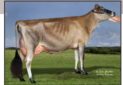
SSF ANDREAS LINDA Grandam of Lot 27

4TH DAM: SSF SUPREME LEE 92% 5-02 305 2 19250 5.0 968 3.5 667 102DCR 2305C 3RD 5-YEAR-OLD, 2011 NEW YORK SPRING SHOW 5TH JR 3-YR.-OLD, 2009 NEW YORK SPRING SHOW