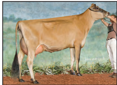
HLF DELUXE EVETTE Fourth Dam of Lot 44