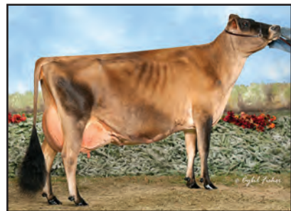
HURONIA CENTURION VERONICA 20J Excellent-97% Fifth Dam of Lot 29