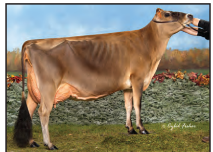
ELLIOTTS COSMO ACTION-ET Dam of Lot 19