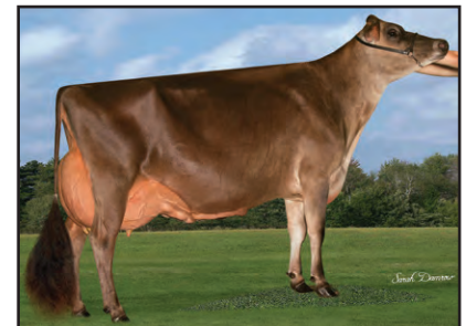
RATLIFF DUALLY ATLEE-ET Sister to the Grandam of Lot 53