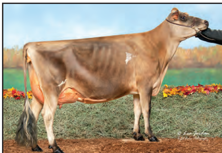
Sold in the 2014 sale Arethusa Excitation Jojo-ET, E-94% 2nd Sr. 3-yr.-old, 2017 Western National