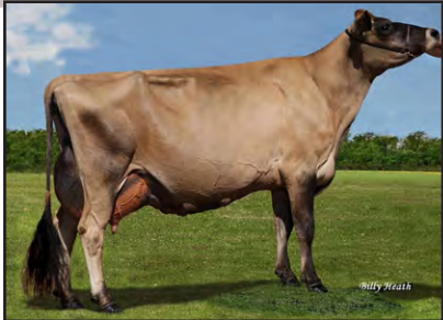
SV/HEATHS HUNTER MASCARA Dam of Lot 2