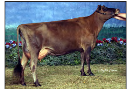
HOMERIDGE F P LISA 2 Excellent-92% Fifth Dam of Lot 25