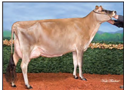
ARETHUSA VERONICAS CUPID-ET Fourth Dam of Lot 29