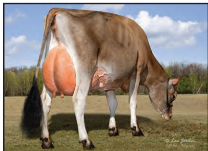
ELLIOTTS CHAVEZ RENEE-ET Sister to the Dam of Lot 24

BORN 08/07/2021 TATTOO /R873 P0 FEMALE EFI 6.3% PA -1658M -44F -46P -380CM$ -380NM$ -394FM$ 0.2PL 2.0DPR 3.2CCR 1.1HCR 3.10SCS PA TYPE 1.2 JPI 34%R -77 ST SR DF RA RW RL FA FU 1.3 -0.1 0.6 H1.9 0.8 P1.0 S1.1 2.5 RH RUW UC UD TP TL RTR RTS 0.8 0.2 0.1 S2.9 C1.0 L0.2