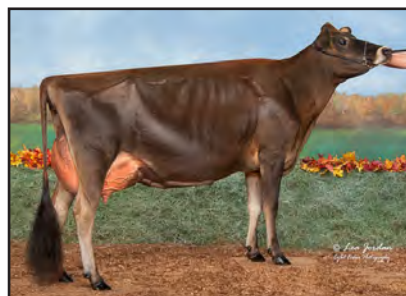
SOUTH MOUNTAIN ANDREAS RASCAL Excellent-91% Daughter of "Radiant"