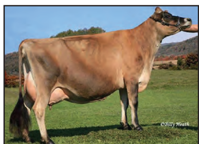
MID-DEL NATE MAMIE Fourth Dam of Lots 6 & 7

BORN 12/21/2021 PO FEMALE EFI 5.5% AMERICAN ID 494/494 PA -1646M -56F -49P -545CM$ -544NM$ -545FM$ -1.0PL -0.4DPR -0.3CCR -0.6HCR 3.10SCS PA TYPE 1.2 JPI 35%R -118 ST SR DF RA RW RL FA FU 2.2 0.7 0.8 H1.2 1.3 PO.9 S1.3 2.6 RH RUW UC UD TP TL RTR RTS 1.4 0.1 0.8 S3.3 C0.4 S0.3