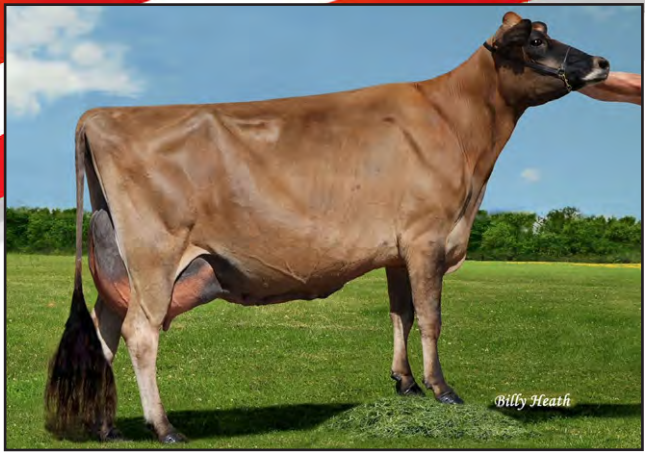
SVHEATHS COLTON MONIQUE, E-95% Sister to Lot 2