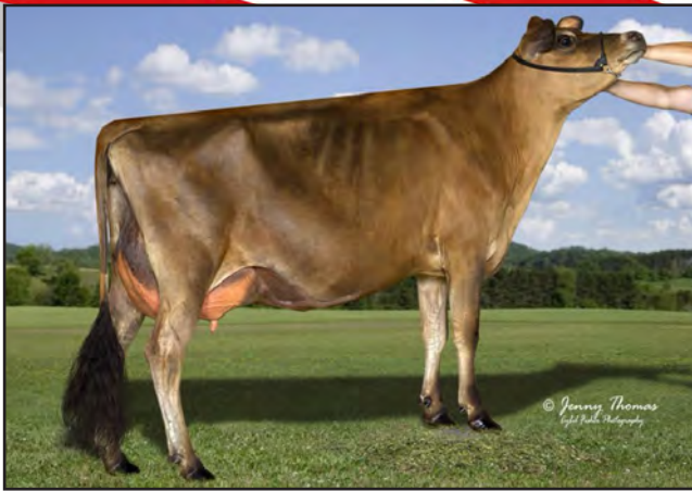
HAWVER CREST LIBSTER JOY, E-90% Grandam of Lot 1