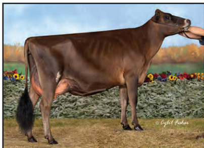
RATLIFF DUALLY PARIS Sister to the Dam of Lot 48