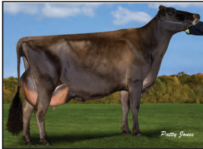
BRIDON LEGION ESSENCE Grandam of Lot 22