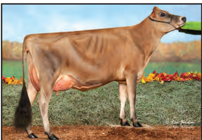
J-KAY APPLEJACK FREYNI-ET Sister to the Dam of Lot 42