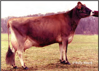
PENSMTIH TJ MINDY {5}, E-94% 1993 National Grand Champion Fifth Dam of Lot 2

BORN 03/06/2022 TATTOO /R898 PO FEMALE EFI 6.2% PA -1637M -50F -50P -442CM$ -441NM$ -435FM$ 0.0PL 2.6DPR 2.9CCR 0.3HCR 3.10SCS PA TYPE -0.3 JPI 29%R -91 ST SR DF RA RW RL FA FU 0.2 0.6 -1.1 H2.2 0.5 P0.3 S0.3 1.4 RH RUW UC UD TP TL RTR RTS -0.9 -0.8 0.2 S1.6 CO.8 SO.1