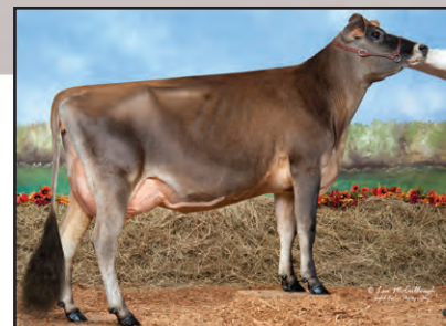
SSF PRESTIGE ICE Very Good-87% From the Same Family as Lot 41

SSF JADE IVANA 90% 8-06 305 2 18410 5.5 1006 3.4 634 102DCR 2191C