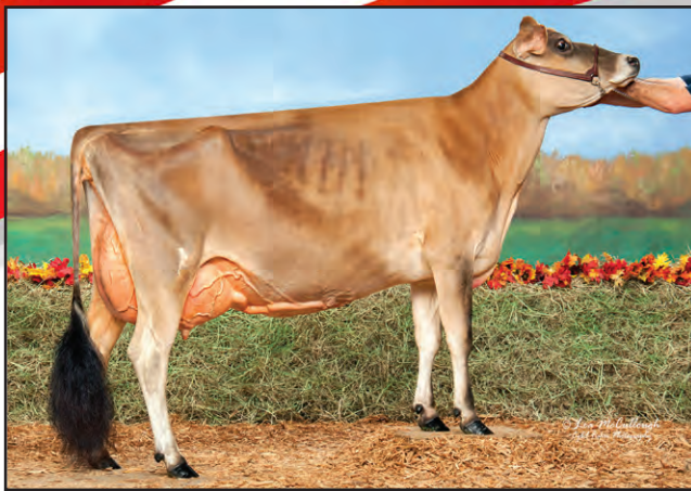
IMPRESSION CLOUD, E-93% Dam of Lot 56