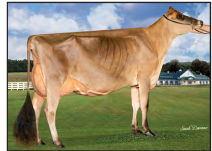
ARETHUSA COLTON CADBURY-ETS Sister to the Dam of Lot 19