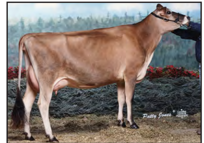
SHAMROCK JUDE JULIANNA Excellent-90% Sixth Dam of Lot 43