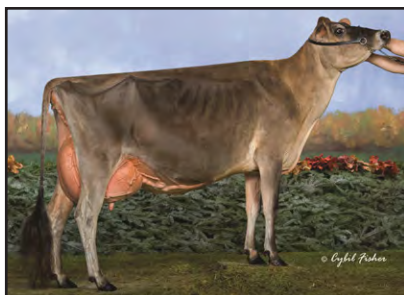
ARETHUSA VERONICAS DASHER-ET Sister to the Dam of Lot 62

BORN 06/19/2019 BBR 100 DHIA HERD # 31-06-1141 CONTROL # 7835 FEMALE EFI 7.1% AMERICAN ID 7835/7835 JH1F JNSC