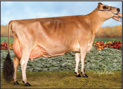
MARYNOLE EXCITE ROSEY Dam of Lot 64