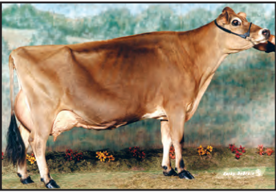
AVONLEA D JUDE KARMEL Great-Grandam of Lot 40