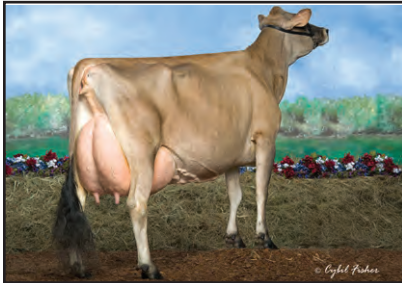
SSF COMISKEY PASSION Excellent-92% From the Same Family as Lot 52

CLEAR VIEW JERSEYS LLC BREEDER ORIENT, OH