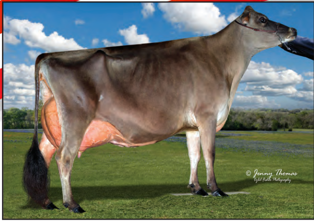
KCJF REGENCY BROOKLYN, E-92% Great-Grandam of Lot 34