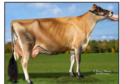
ARETHUSA HG VINA-ET Sister to the Grandam of Lot 21