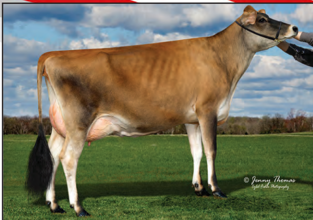
SSF GOVERNOR IRIS, E-90% From the Same Family as Lot 41