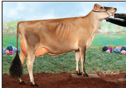
ELLIOTTS REGENCY CORRINA-ET Sister to the Grandam of Lot 54