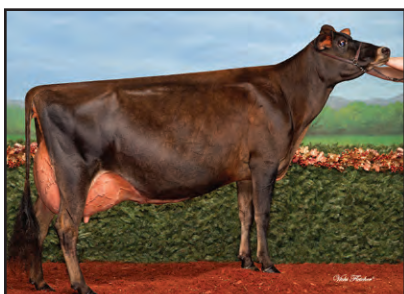
ARETHUSA ON TIME VOGUE-ET Sister to the Dam of Lot 62