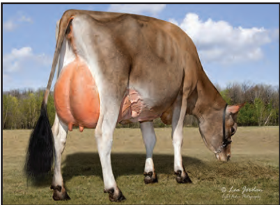
ELLIOTTS CHAVEZ RENEE-ET Sister to Lot 64

BORN 09/06/2018 TATTOO HV74/HV74 DHIA HERD # 31-79-1133 CONTROL # 613 FEMALE EFI 6.5% AMERICAN ID 613/613