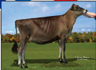
HOWACRES C VIOLA ETV-ET Sister to Lot 62