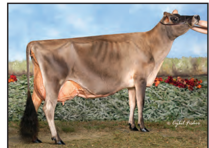
ARETHUSA VERONICAS COMET-ET Grandam of Lot 19