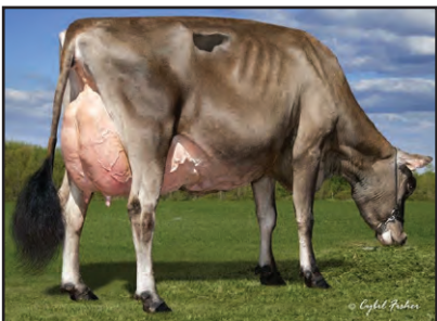
HARMONY CORNERS FOBIA Sister to the Grandam of Lot 42