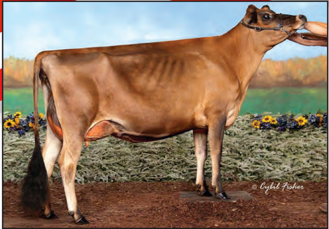
M-SIGNATURE VERBATIM THETA MARIE, E-91% Grandam of Lot 26