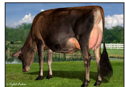
ARETHUSA TEQUILA VANNA Sister to the Grandam of Lot 21