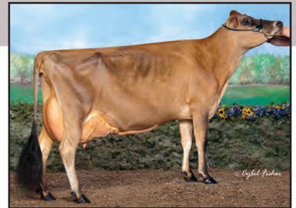
SOUTH MOUNTAIN JASMINES JOURNEY Fourth Dam of Lot 43

NEXT DAM: JEMI TQ JOSIE 93% 6TH 5-YEAR-OLD, 2017 ALL AMERICAN JERSEY SHOW GRAND CHAMPION, 2017 INDIANA STATE SHOW 1ST 5-YEAR-OLD, 2017 NEW YORK SPRING SHOW 3RD 4-YEAR-OLD, 2016 ALL AMERICAN JERSEY SHOW 5TH 4-YEAR-OLD, 2016 WORLD DAIRY EXPO RES. GRAND CHAMPION, 2016 KENTUCKY STATE FAIR RES. SENIOR CHAMPION, 2016 INDIANA STATE FAIR RES. INTERMEDIATE CHAMP, 2015 INDIANA STATE FAIR SENIOR CHAMPION, 2015 INDIANA STATE SHOW SIRE: TOWER VUE PRIME TEQUILA-ET GJPI -205 0%ILE