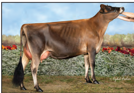
Sold in the 2011 sale Hixson Indiana Ilene, E-92% Reserve Junior All American Jr. 2-yr.-old, 2012