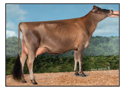
RIVER VALLEY MARMIE R MARVEL-ET Grandam of Lot 35