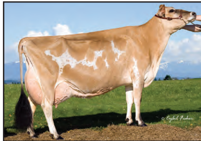
PLEASANT NOOK F PRIZE CIRCUS Excellent-97% • 2-time National Champion Fifth Dam of Lot 54