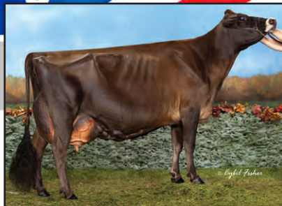
RATLIFF MINISTER PORSCHA-ET Grandam of Lot 48