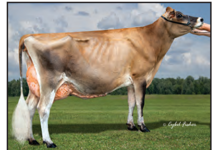
SCHULTE BROS TEQUILA LIZZY-ET Excellent-92% From the Same Family as Lot 25

4TH DAM: PARTEE AT BUDJON FUROR LAYLA 90%