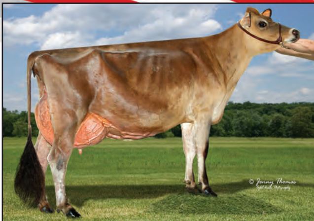
GENTRY CHILLER, E-93% Dam of Lot 29