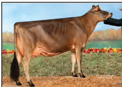
RATLIFF EXCITATION PETUNIA-ET Sister to the Dam of Lot 48