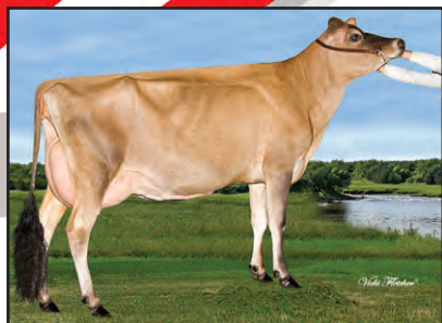
RAPID BAY CONNECTION ROSIE-ET Grandam of Lot 30

DILEY JERSEYS & WILLIAMS JERSE BREEDER & OWNER CANAL WINCHESTER, OH