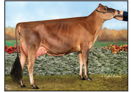
CROSSBROOK IMPRESSION DASHER-ET Sister to the Dam of Lot 9