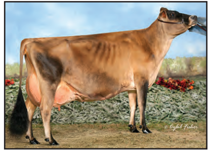
HURONIA CENTURION VERONICA 20J Grandam of Lot 59