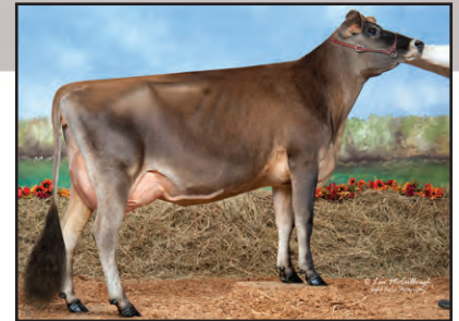
SSF PRESTIGE ICE Very Good-87% From the Same Family as Lot 57

4TH DAM: SSF GOVERNOR IRENE 88% 4-05 298 2 17260 5.2 895 3.6 618 88DCR 2136C