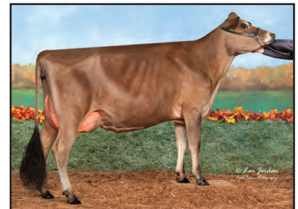
LAWTONS GENTRY FLASH From the Same Family as Lot 47