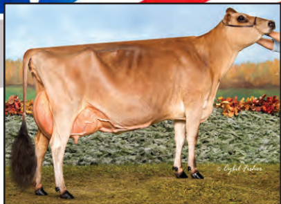
MARYNOLE EXCITE ROSEY Grandam of Lot 24