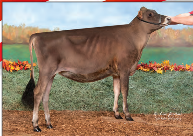
BK-MOR JOEL BACARDI Selling as Lot 36