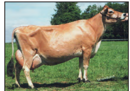
FAMILY HILL BROOK LYNNA, E-94% Fifth Dam of Lot 1