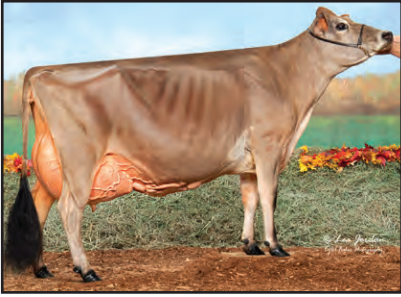
PAGE-CREST GATOR KANDI-ET Sister to the Dam of Lot 40

4TH DAM: AVONLEA JUNO KERSEY-ET GP 80 (CAN) 6-02 305 2 15982 4.3 684 3.8 615 CAN 1950C