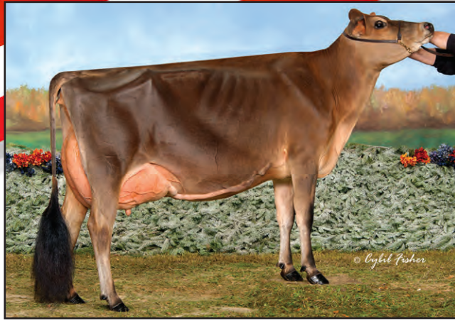
CHILLI PREMIER CINEMA-ET, E-93% Great-Grandam of Lot 54