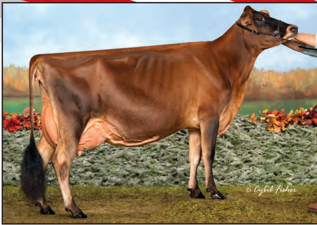
JEMI TQ JOSIE, E-93% Great-Grandam of Lot 43