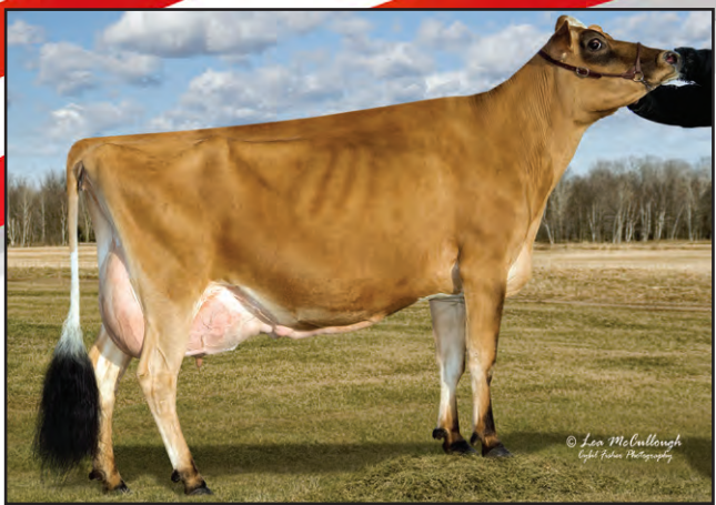
HARMONY CORNERS GRETCHEN, E-94% Fourth Dam of Lot 28