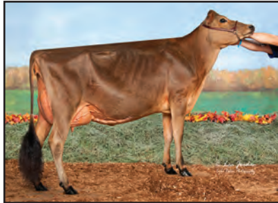
SCHULTE BROS SHOWDOWN GLAM Dam of Lot 4