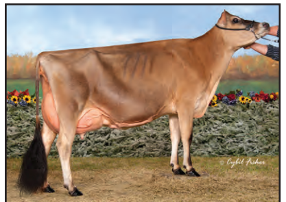
STONEY POINT GILLER FARRAH-ET Excellent-94% Same Family as Lot 65