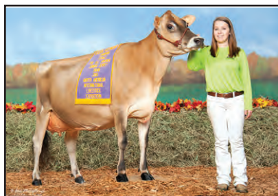
IMPRESSION CLOUD Reserve Intermediate Champion, 2016 All American Junior Show

WILLIAMS JERSEYS & WILLIAMS ER BREEDER & OWNER MC CONNELLSVILLE, OH 740-962-5819