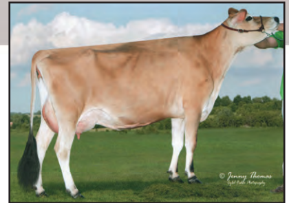
HARMONY-CORNERS LIBBY Great-Grandam of Lot 1

SISTER(S): HAWVER CREST LIBSTER ANGEL 91% 5-05 305 2 18840 5.9 1108 3.8 708 101DCR 2449C 2ND INTERMEDIATE YEARLING, 2012 OH SPRING DAIRY EXPO 3RD INTERMEDIATE YEARLING, 2011 OH STATE FAIR HAWVER CREST TEQUILA LIZZY 90% 3-01 305 2 20050 4.4 878 3.5 695 98DCR 2366C HAWVER-CREST LOLLIPOP 91% 5-03 305 3 19390 5.4 1043 3.7 709 93DCR 2452C HARMONY CORNERS HELENS LILLY 84% 2-00 305 2 16240 4.5 729 3.5 575 97DCR 1962C