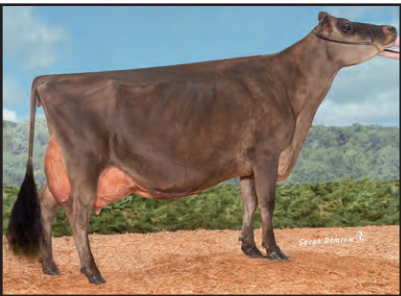
RATLIFF REN KENDRA-ET Sister to the Grandam of Lot 40