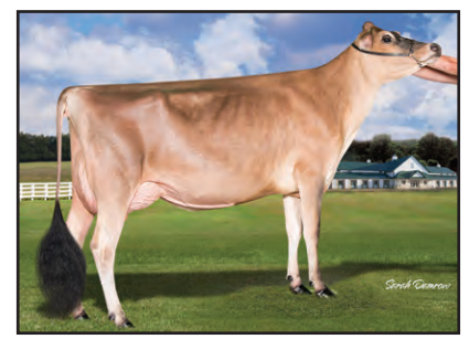
RIVER VALLEY CHROME MARMADAISY Dam of Lot 35