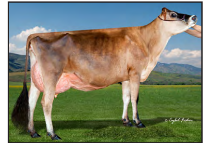
DIXIES PREMIER DARLING-ET Sister to Lot 9