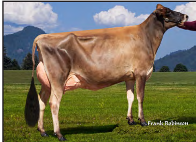
SVHEATHS APPLEJACK MADELINE Sister to Lot 2