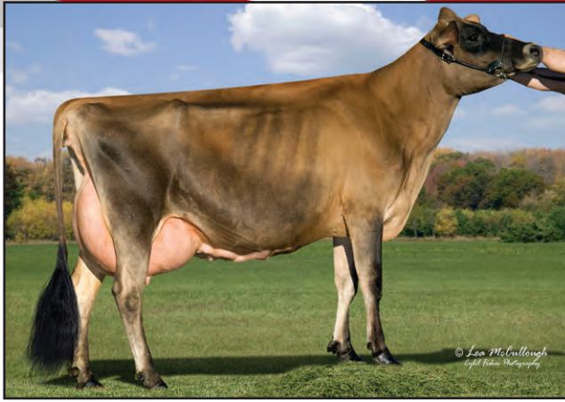
SSF SUPREME LEE, E-92% Fourth Dam of Lot 27