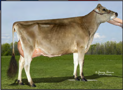
SOUTH MOUNTAIN CASINO RIVER-ET Selling as Lot 64