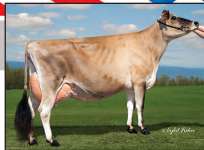
TOWER-VUE JM COMERICA THUMPER Dam of Lot 63

PLEASANT NOOK J IMP TOOTS VG 86 (CAN) 4-01 305 2 13947 5.1 714 3.9 549 CAN 1901C