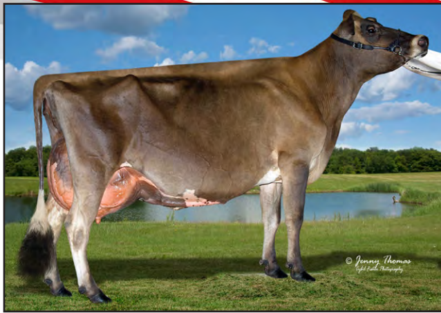
ARETHUSA GRAND VEANNA, E-93% Grandam of Lot 21