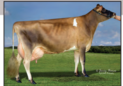
LAWTONS IATOLA FLICKA Grandam of Lot 47

4TH DAM: LAWTONS LEGION FRECKLE 85% 5-10 305 2 25680 4.4 1140 3.2 832 102DCR 2872C