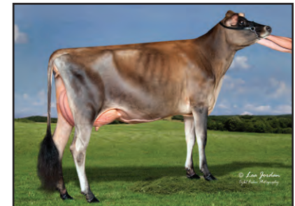
SSF VIP LELIE Excellent-90% From the Same Family as Lot 27