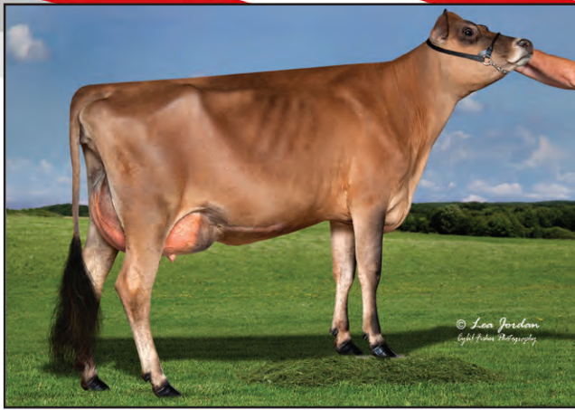
LAWTONS HIRED GUN FIRE, VG-87% Dam of Lot 47