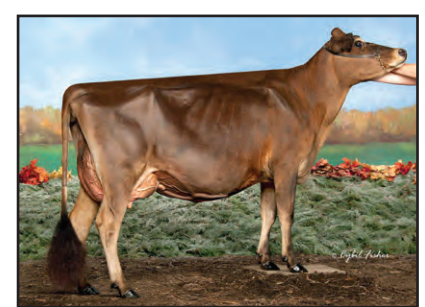
RIVER VALLEY HLH VIP MISGUIDED Sister to Lot 35