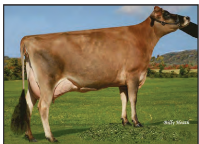
UNDERGROUND DUAISEOIR C MAMIE-ET Grandam of Lots 6 & 7