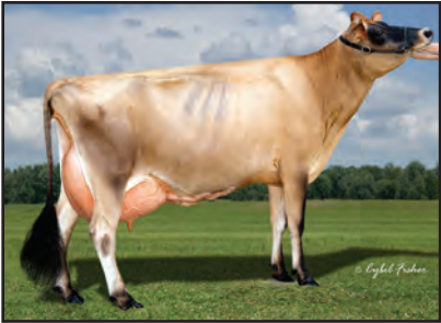
SCHULTE BROS VIN GRACIE-ET Sister to the Grandam of Lot 4