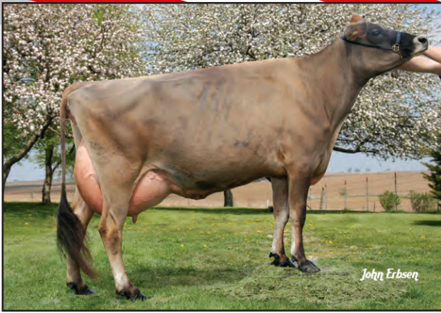
BRENBE SULTAN FEATHER, VG-87% Fifth Dam of Lot 5