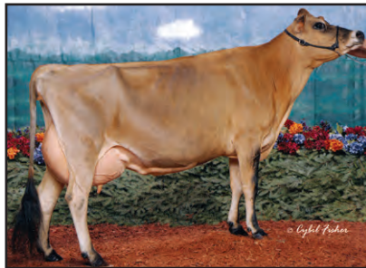
TOWER VUE TERROR Sister to the Dam of Lot 63