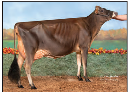
MILK & HONEY VADEN FERN-ET Sister to the Grandam of Lot 65