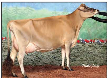
RAPID BAY FATAL ROSE-ET Great-Grandam of Lot 30