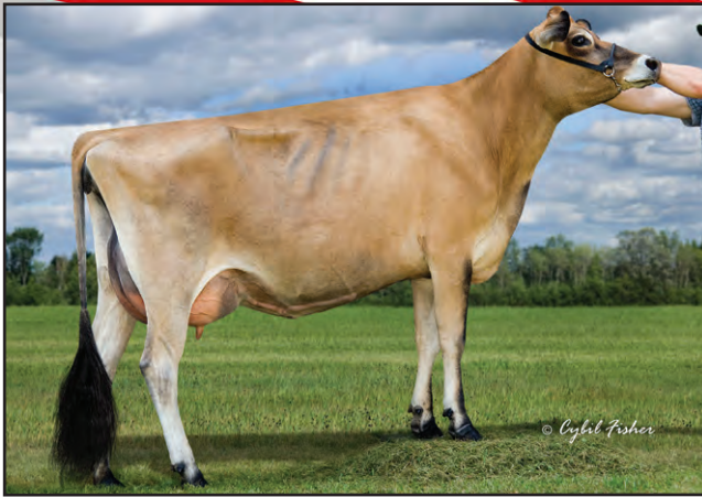
PARTY AT BUDJON FUROR LAYLA, E-90% Fourth Dam of Lot 25