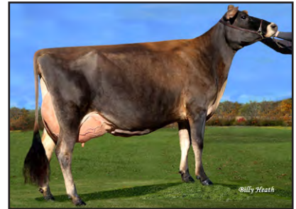
STONEY POINT VINDICATION FALINE Fourth Dam of Lot 65