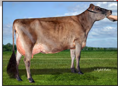
UNDERGROUND JAN MAMIE JENNA-ET Dam of Lots 6 & 7