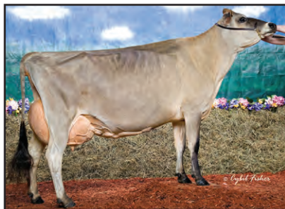
PLEASANT NOOK SAMBO TEAL Grandam of Lot 63