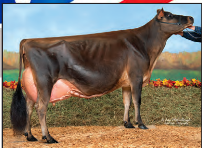
HARMONY CORNERS FOZZY-ET Grandam of Lot 42