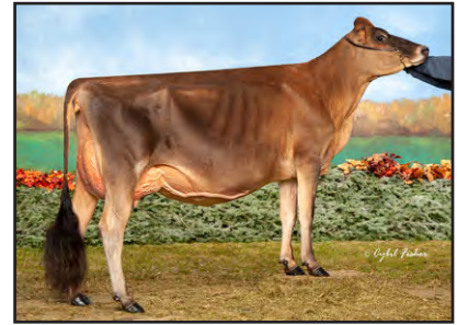
SOUTH MOUNTAIN FIZZ CHABLIS-ET Sister to Lot 19