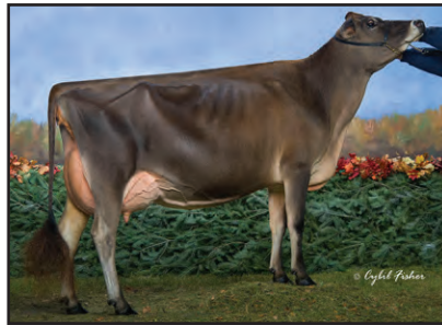
TOWER VUE TOBAGO-ET Sister to the Dam of Lot 63