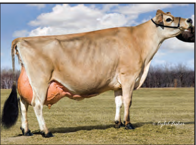
RATLIFF F PRIZE KANSAS-ET Sister to the Grandam of Lot 40