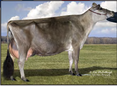
RENN KANDIE OF RATLIFF Grandam of Lot 40

MOON VALLEY FARM LIMITED BREEDER & OWNER FAIR GROVE, MO