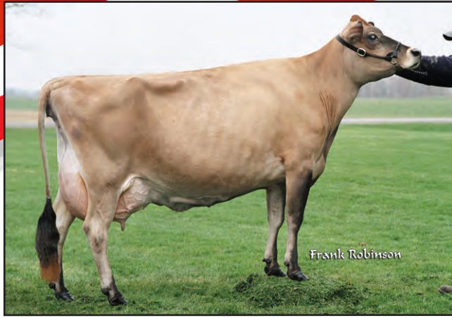
LLOLYN F PRIZE POLLYANNA, EX 92-3E (CAN) Fourth Dam of Lot 10