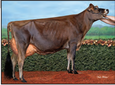
SCHULTE BROS TEQUILA SHOT-ET Sister of the Grandam of Lot 4