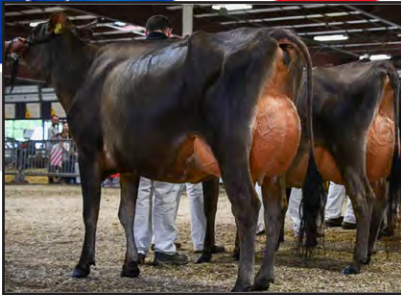
BRIDON PNV EMBRACE-ET Dam of Lot 22