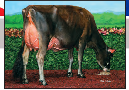
CROSSBROOK HG DIXIE-ET Dam of Lot 9

4TH DAM: GENESIS RENAISSANCE VIVIANNE VG 87 (CAN) 5-00 305 2 12110 4.2 514 3.8 461 CAN 1464C