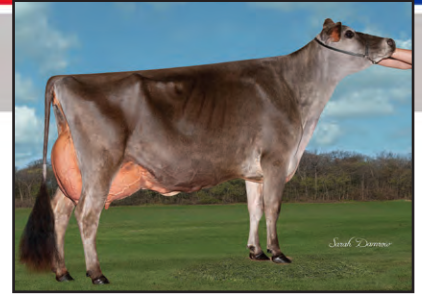
RATLIFF IMPRESSION ANNABELLA-ET Grandam of Lot 53

SISTER(S): RATLIFF ACTION ANGEL 95% 7-01 305 2 24930 5.0 1250 3.4 855 96DCR 2954C RATLIFF SAMBO ASPEN-ET 93% 5-00 303 2 17310 4.9 849 3.7 649 98DCR 2245C RATLIFF ACTION ADDISON-ET 91% 4-06 305 2 16070 5.0 803 3.7 588 94DCR 2033C RATLIFF TEQUILA AVELANCHE-ET 93% 3-09 305 2 23320 5.4 1270 3.7 857 95DCR 2964C RESERVE ALL AMERICAN MILKING YEARLING, 2014 RATLIFF IMPRESSION ANNIE-ET 92% 3-01 305 2 14790 4.8 714 3.6 528 95DCR 1825C RATLIFF IMPRESSION ARLENE-ET 92% 3-02 303 2 16760 5.7 952 4.0 675 94DCR 2337C RATLIFF APPLE JACK ACCENT-ET 91% 2-11 305 2 16560 4.5 738 3.7 613 95DCR 2032C 7TH MILKING YEARLING, 2015 ALL AMERICAN JERSEY SHOW RATLIFF SAMBO APACHE-ET 93% RATLIFF SAMBO ANN-ET 93% RATLIFF SAMBO ALISON-ET 91% 4-09 305 2 23830 5.0 1183 3.7 883 96DCR 3054C 4TH, 2017 NATIONAL JERSEY JUG FUTURITY RATLIFF EXCITATION ALANA-ET 90% 5-03 305 2 21160 4.8 1014 3.7 781 77DCR 2701C RATLIFF INDIANA AUBREY-ET 89% 2-03 305 2 19950 5.7 1142 3.8 762 92DCR 2637C RATLIFF EXCITATION ALMIRA-ET 92% RATLIFF APPLE JACK ANSLEY-ET 90% 2-10 305 2 17960 5.2 937 3.6 638 96DCR 2205C RESERVE ALL AMERICAN MILKING YEARLING, 2017 RATLIFF DUALLY ATLEE-ET 94% 5-01 305 2 18590 5.3 976 4.1 766 96DCR 2627C RATLIFF VELOCITY ALPHA-ET 92% 3-09 238 2 15880 5.2 822 3.5 563 92DCR 1946C