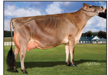
UNDERGROUND L MAMIE LOLA-ET From the Same Family as Lots 6 & 7