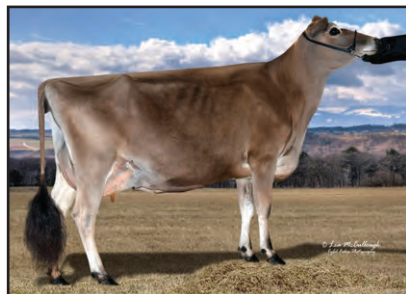
WOODMOHR INDIANA ROSEBUD Great-Grandam of Lot 24