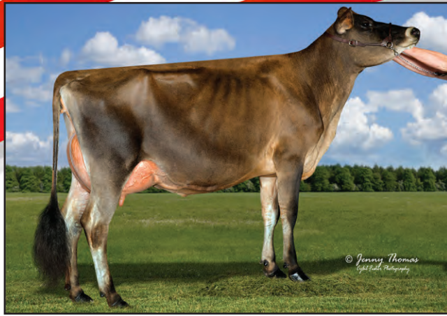
GOJ CORDIE GOVERNOR CAROLINE, VG-88% Sister to the Dam of Lot 58