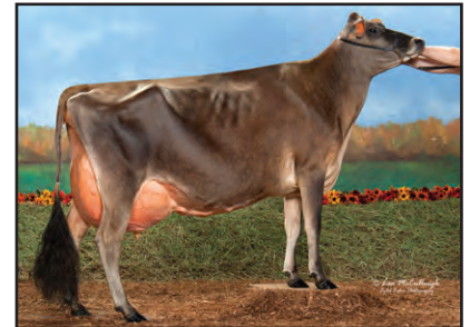
RATLIFF ACTION ANGEL Sister to the Grandam of Lot 53