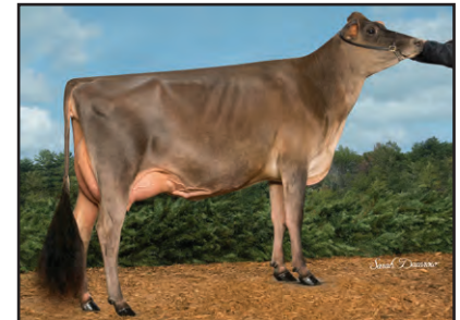
RATLIFF APPLE JACK ANSLEY-ET Sister to the Grandam of Lot 53