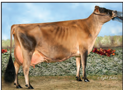
HURONIA CENTURION VERONICA 20J Grandam of Lot 62