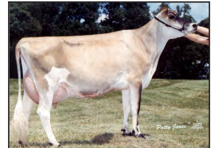
SSF BARBER LIBBY Excellent-93% From the Same Family as Lot 27