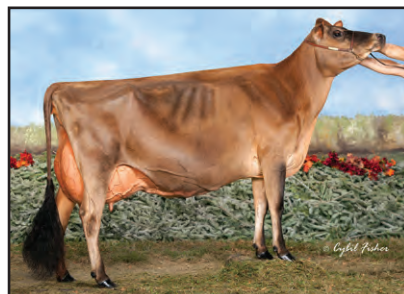
MILO VINDICATION SEASON-ET Great-Grandam of Lot 20