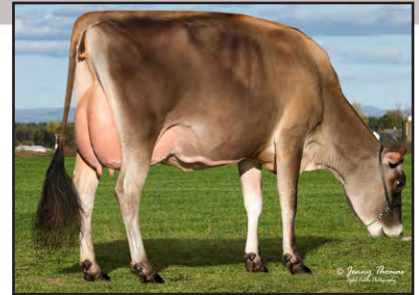
UNDERGROUND MADDIE MAMIE-ET Sister to the Grandam of Lots 6 & 7

NEXT DAM: UNDERGROUND CENTURION MAMIE 92% 7-01 305 2 17960 5.5 985 3.7 667 96DCR 2307C SIRE: SOONER CENTURION-ET GJPI -69 3%ILE