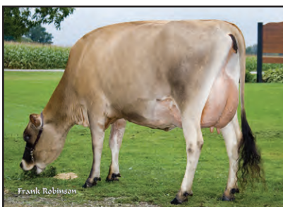
BRIDON LS ECHO-ET Great-Grandam of Lot 22