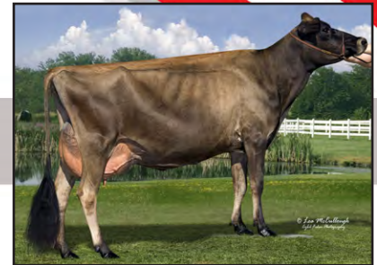
ARETHUSA RESPONSE VANITY-ET Great-Grandam of Lot 21