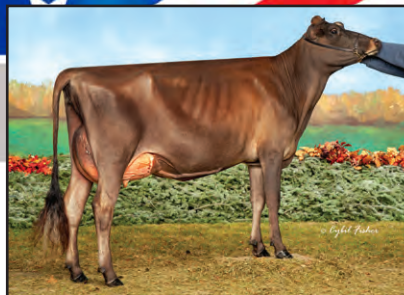
ARETHUSA ANDREAS SUNLIGHT-ET Dam of Lot 20