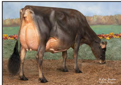
ELLIOTTS FIZZ CHARADE-ET Sister to the Grandam of Lot 54