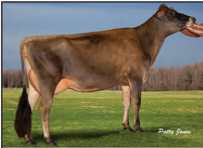
BRIDON VINCENT EXPEL Sister to the Grandam of Lot 22