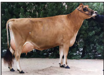
RATLIFF HERMITAGE PENELOPE Fourth Dam of Lot 48