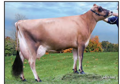
LAWTONS AVIATOR FEATHER Great-Grandam of Lot 47