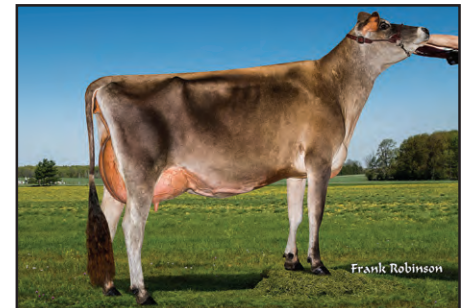
Sold in the 2014 sale M-Signature Valentino Sophie-ETS 1st Sr. 2-yr.-old, 2015 Michigan Dairy Expo