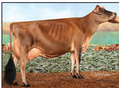
ARETHUSA HG SVANA-ET Sister to the Grandam of Lot 20

BORN 09/02/2021 PO FEMALE EFI 6.1% AMERICAN ID 34/34