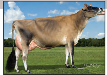
SELECT JADE EMMY-ET, E-94% From the Same Family as Lot 61

4TH DAM: POTWELL WHISTLERS EMILY EX 92 (CAN) 5-00 305 2 20925 4.2 882 3.7 767 CAN 2477C 2ND JR 3-YEAR-OLD, 2005 ROYAL WINTER FAIR 2ND JR 2-YEAR-OLD, 2004 ROYAL WINTER FAIR RESERVE ALL CANADIAN JR 3-YEAR-OLD, 2005 RESERVE ALL CANADIAN JR 2-YEAR-OLD, 2004 RESERVE ALL CANADIAN SUMMER YEARLING, 2003 NOMINATED ALL-CANADIAN 5-YEAR-OLD, 2007