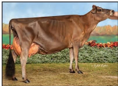
SOUTH MOUNTAIN VOLTAGE RADIANT-ET Sister to the Dam of Lot 24