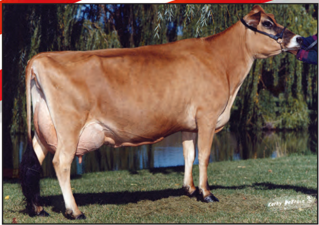
DUNCAN EILENE OF HLF, E-96% Seventh Dam of Lot 44