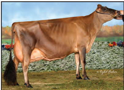
ARETHUSA RESPONSE VIVID-ET Sister to the Dam of Lot 62