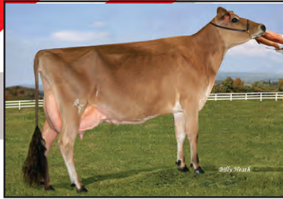
FAMILY HILL CONNECTION CHILLI-ET Fourth Dam of Lot 54