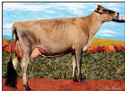
CAMPBELL TB VERB ROSALIE-ET Sister to the Dam of Lot 30