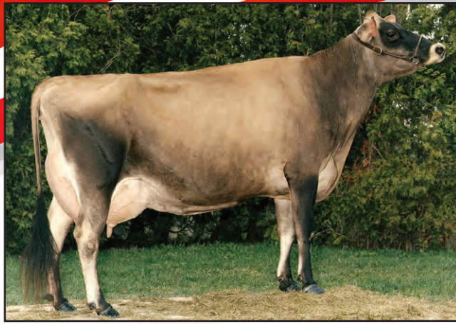
SSF CHAPMAN POMP, E-94% From the Same Family as Lot 52