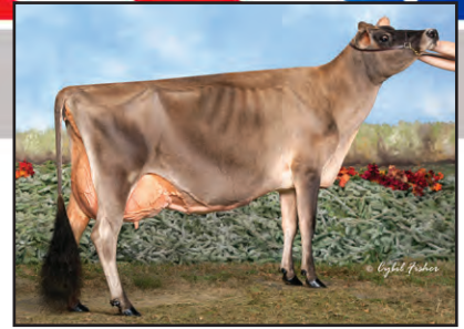
ARETHUSA VERONICAS COMET-ET Dam of Lot 59

NEXT DAM: GENESIS RENAISSANCE VIVIANNE VG 87 (CAN) 5-00 305 2 12110 4.2 514 3.8 461 CAN 1464C 4TH DAM: GENESIS JUNO VIRGINIA SUP-EX 92-6E (CAN) 3-02 305 2 20434 5.9 1200 3.9 803 CAN 2780C