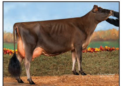
ELLIOTTS FAXON COMICAL-ET Sister to Lot 59