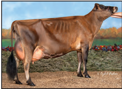
BLUE MOUNTAIN TEQUILA TINA MARIE Fourth Dam of Lot 26

BORN 07/12/2021 TATTOO MC62/ PO FEMALE EFI 4.9% PA -2186M -51F -58P -560CM$ -560NM$ -588FM$ -1.9PL 0.3DPR 1.1CCR -0.1HCR 3.24SCS PA TYPE 0.7 JPI 30%R -124 ST SR DF RA RW RL FA FU 1.4 -0.1 0.2 H1.3 0.4 P0.7 S1.1 2.6 RH RUW UC UD TP TL RTR RTS 0.7 -0.6 0.0 S3.4 C0.0 L0.3