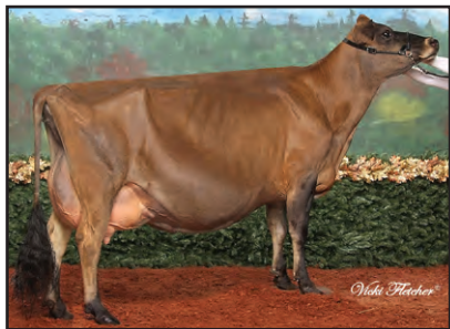
RAPID BAY WHISTLERS RUMOR Fourth Dam of Lot 30

BORN 06/02/2021 PO FEMALE EFI 7.5% AMERICAN ID 6212/6212