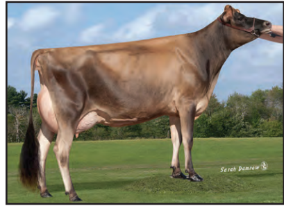
HARMONY CORNERS GINGERALE Sister to the Grandam of Lot 28