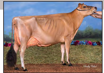
BUSHLEA GALAXIE FERNLEAF 4 EX 90 (AUS) Intermediate Champion, 2016 IDW Show Same Family as Lot 31

KELLOGG-BAY TEQUILA FEVER 91% 3-05 305 3 22150 5.0 1104 3.6 792 96DCR 2738C