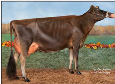
SOUTH MOUNTAIN ANDREAS RASCAL Excellent-91% Daughter of "Radiant"