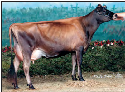
JASPAR RENAISSANCES EVENING Fourth Dam of Lot 22

BORN 09/01/2021 PO BBR 100 FEMALE EFI 7.1% AMERICAN ID 477/477 JH1F JNSF