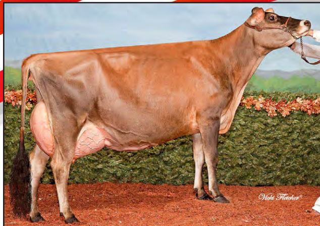
GENESIS EXCAVATE JADE, EX 90-2E (CAN) Great-Grandam of Lot 14