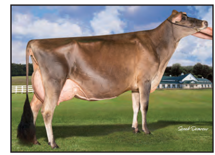
RIVER VALLEY TEQLA MARMALICIOUS Sister to the Grandam of Lot 35