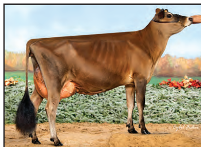
ARETHUSA IMPRESSION SUNSHINE-ET Grandam of Lot 20