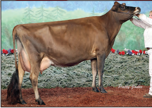
POTWELL WHISTLERS EMILY, EX 92 (CAN) Fourth Dam of Lot 61